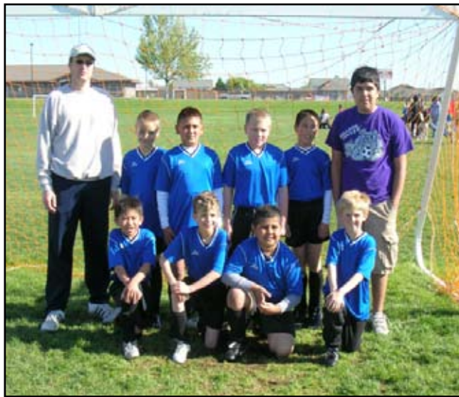
Teams can have their pictures taken by Northwest Photography on March 21 and March 28. Coaches will receive an email shortly with complete details.

Northwest Photography is scheduled to take team photographs at the T-CYSA Complex on Saturday, March 21 and Saturday, March 28. Coaches will be contacted by Northwest Photography via email prior to that date to schedule their team's appointment.